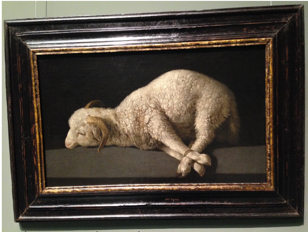
This is art in the Prado museum in Spain