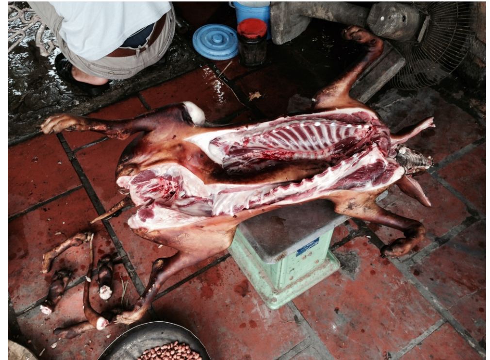
This is from a dog slaughterhouse in North Vietnam